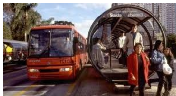
Curitiba City in Brazil