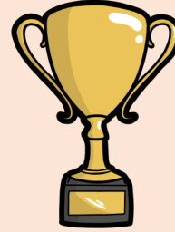
'H' Cup Chipo M

Each of you are excellent role models for your peers and have shown significant determination and effort to your learning.