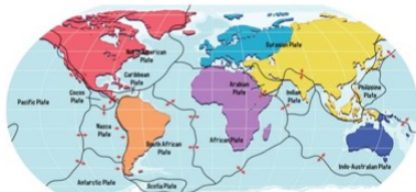
Tectonic Plate Map