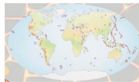
Map of Volcanoes