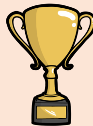
'H' Cup Jaiden Giles

Each of you are excellent role models for your peers and have shown significant determination and effort to your learning.