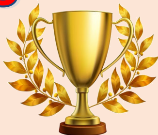
McIver Cup Crew Clapham