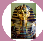
Tutankhamun: The youngest pharaoh of Ancient Egypt.