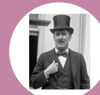
Howard Carter: British archaeologist who discovered Tutankhamun's tomb.