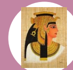
Cleopatra VII: The last pharaoh of Ancient Egypt